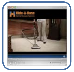
Watch the Video See how easy it works! www.hideahose.biz